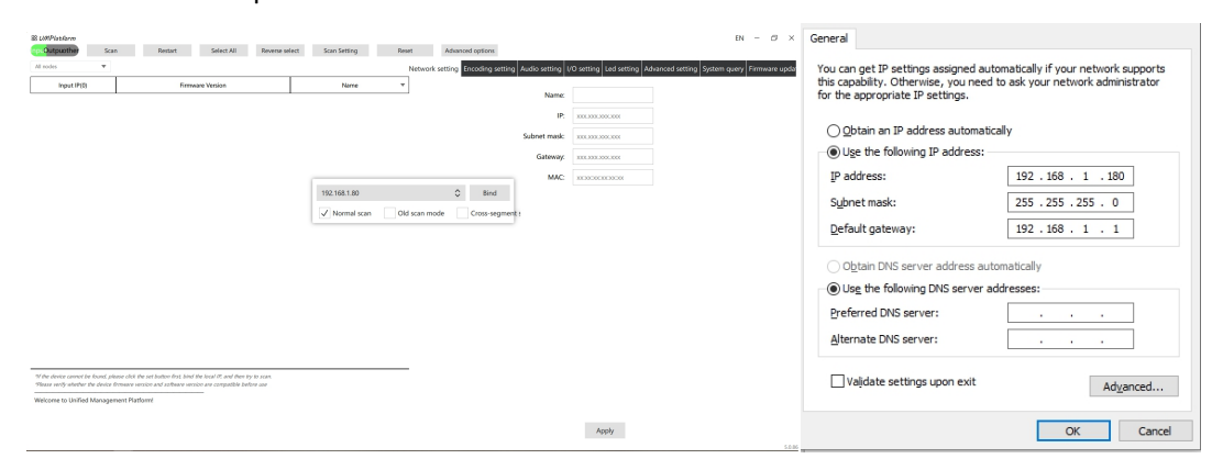
Step 2 : Click the Input, then hit the "Scan" button, it will show all the available nodes on the list. Now users can change the names, resolution, audio, I/O, OSD etc functions from the right side:

Step 1: Scan settings, mainly to bind the control computer IP address with this setting software, here take the computer IP address is 192.168.1.180: